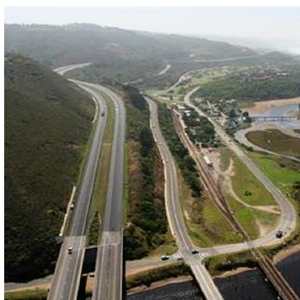
The route to be reconstructed is indicated by the dotted line on the right.

GARDEN ROUTE NEWS - The contract for the rehabilitation of approximately 8km of Station Road and Morrison Road between Great Brak River and Glentana has recently been awarded and the works will commence shortly.